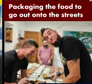
Packaging the food to go out onto the streets