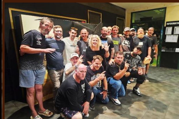
FOM Section of the Together Film