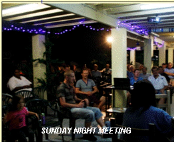
SUNDAY NIGHT MEETING